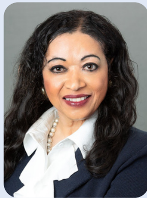
Honorable Denise Langford-Morris