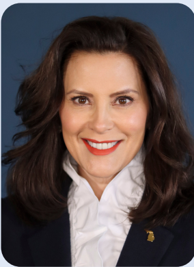
Governor Gretchen Whitmer