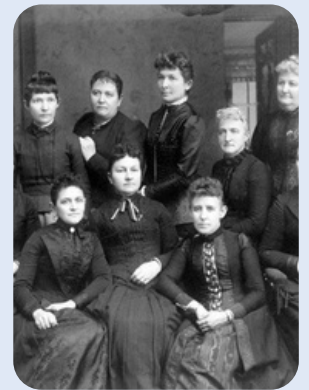
Traverse City Ladies Library Association

On Wednesday, December 6th , Michigan Women Forward will induct these remarkable women into the Michigan Women's Hall of Fame where their legacy will live on forever, inspiring Michigan women to reach beyond their wildest dreams. We invite you to join us as we honor and celebrate these women, who are a testament to the limitless potential of Michigan women.